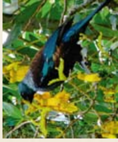
Tui in a Kowhai Tree

Minimum attendance 8 persons or pro rata increase in attendance fee.