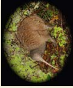
The North Island Brown Kiwi

Minimum attendance 8 persons or pro rata increase in attendance fee.